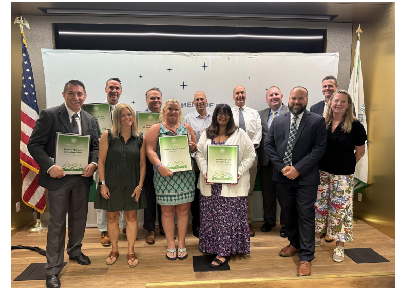
Two PPSD schools win US DOE Green Ribbon School award!