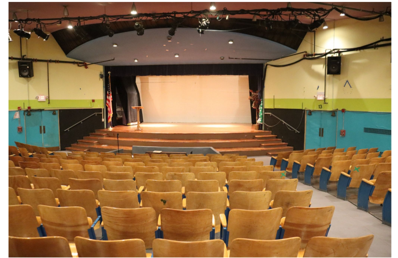
Auditorium Upgrades & Repairs In partnership with City Council