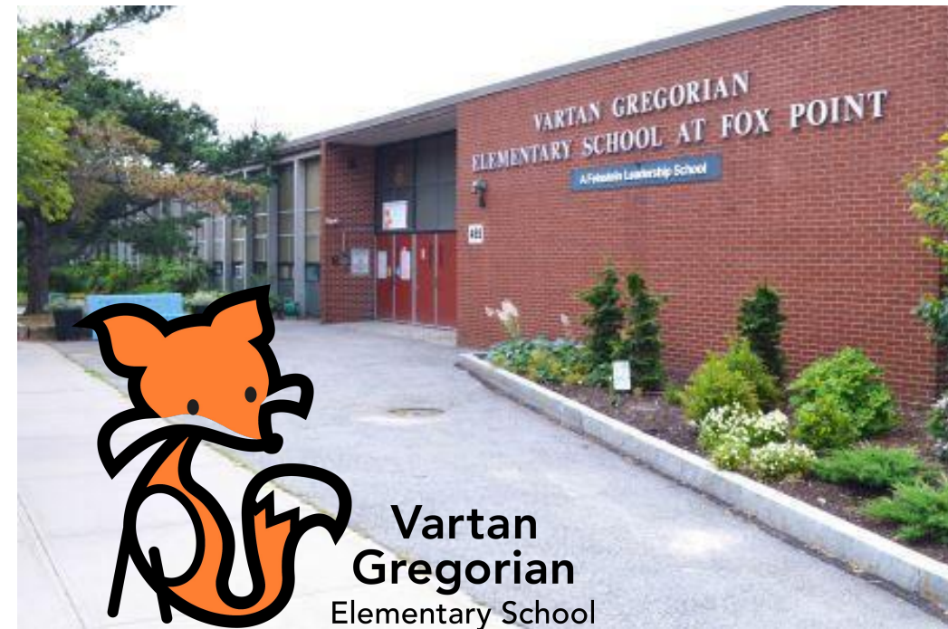
Vartan Gregorian Elementary School