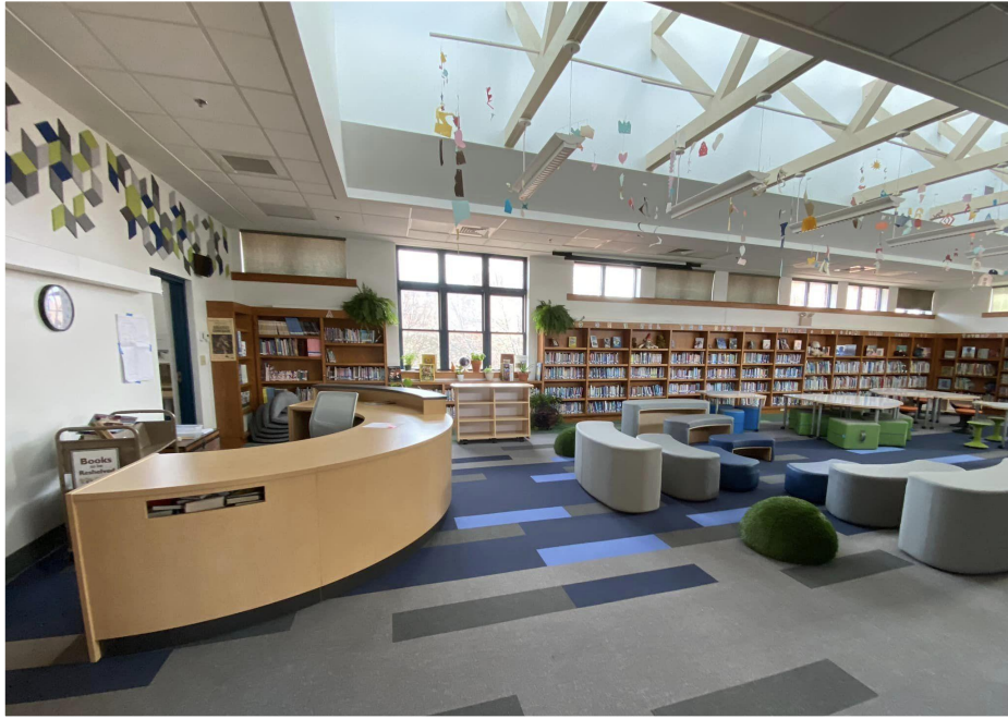
Media Center Renovation & Furniture

Funded by RIDE facilities equity initiative