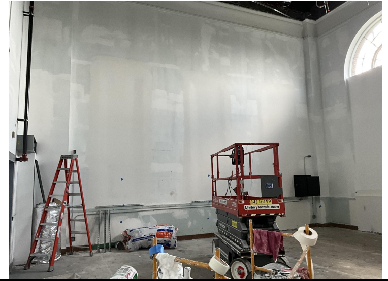
Dance studio construction at Hope High School