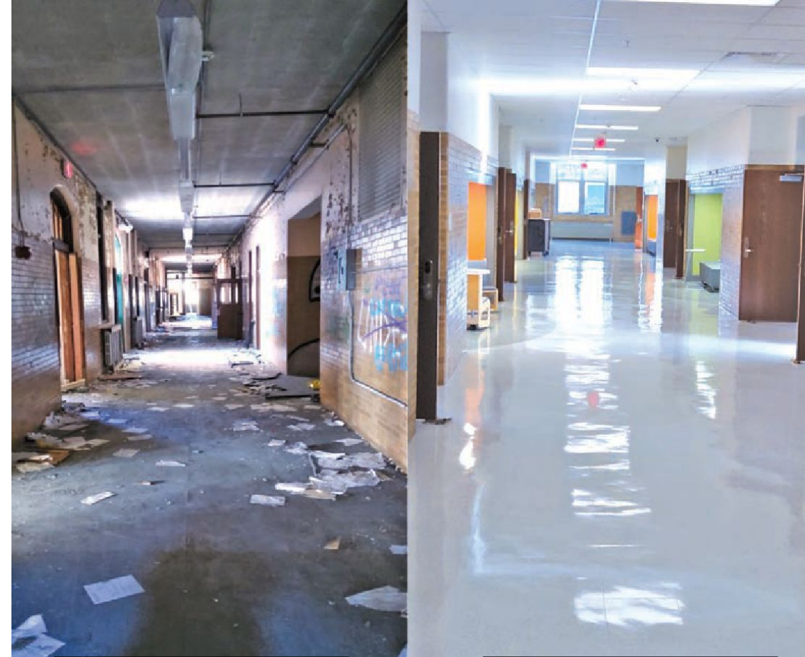
The abandoned Windmill Ave. school